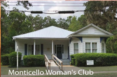
Monticello Woman's Club