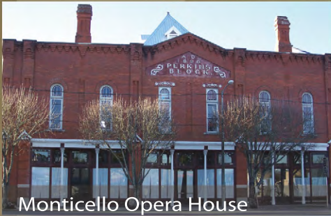
Monticello Opera House