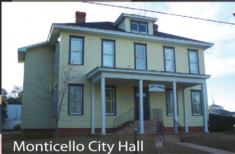
Monticello City Hall